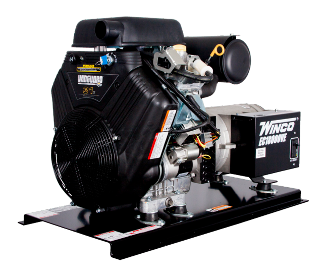
B & S Commercial Vanguard Engine.