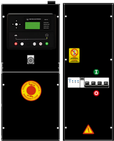
Pictures of Control Panel RH and Distribution Panel LH may include optional equipment and/or accessories

Alternator alarms included: Overload, unbalanced voltage, over voltage, under voltage, over frequency, under frequency, short circuit, reverse power, and incorrect phase sequence.