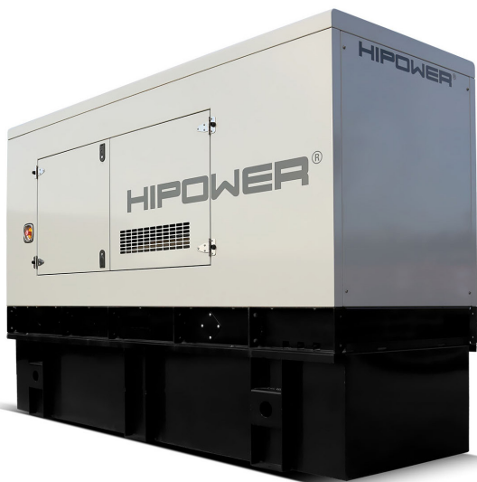
Generator depicted with sound attenuated option, some accessories for display only.